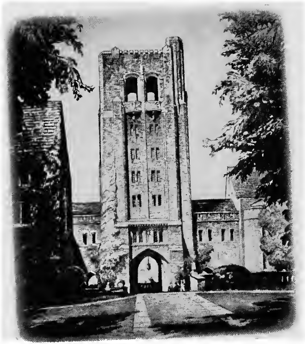
Cornell Law School Library